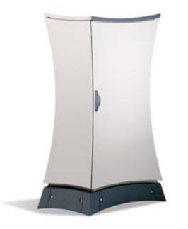
100% compact technology