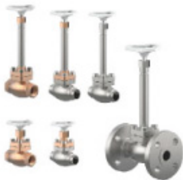
CRYOGENIC GLOBE VALVE