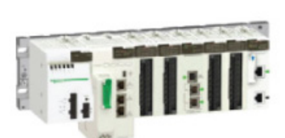
PROGRAMMABLE LOGIC CONTROLLERS