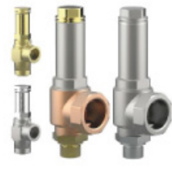
CRYOGENIC SAFETY RELIEF VALVE