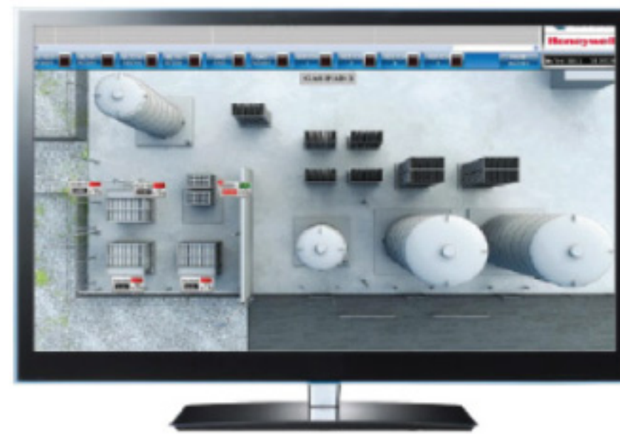
SCADA / HMI