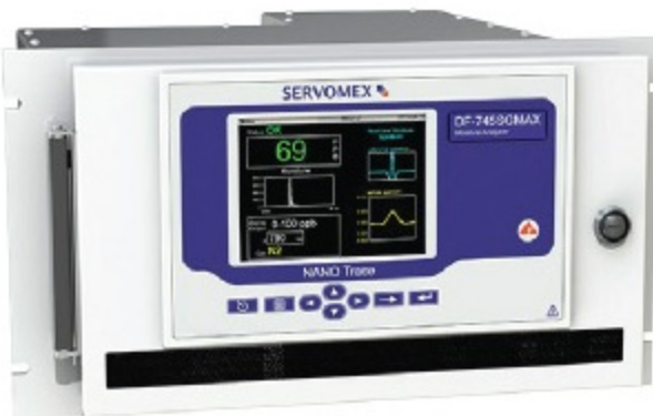
DF 700 SERIES Moisture Analyzer