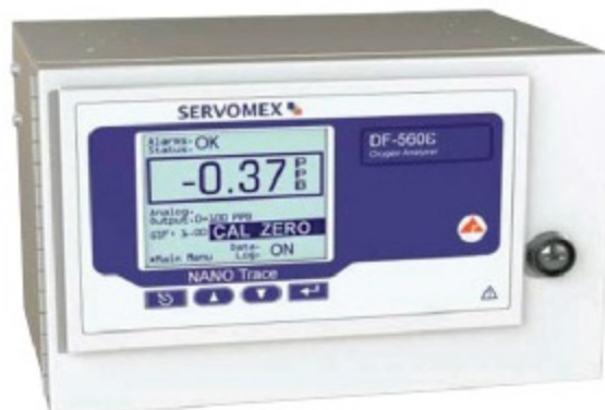
DF 500 SERIES Oxygen Analyzer