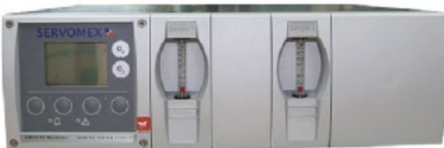
SERVOPRO MultiExact 5400