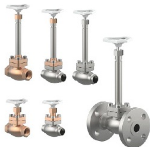
CRYOGENIC GLOBE VALVE