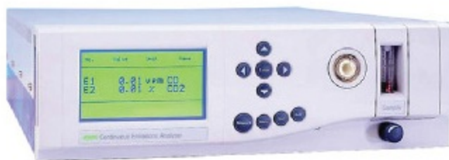
SERVOPRO 4000 SERIES