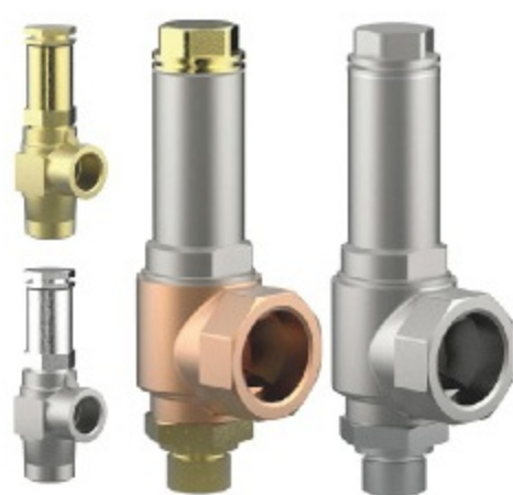
CRYOGENIC SAFETY RELIEF VALVE