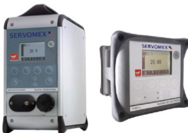
SERVOFLEX 5000 SERIES