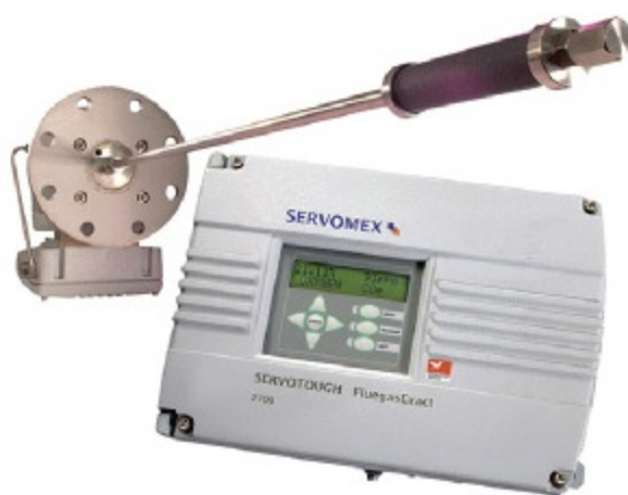
SERVOTOUGH FlueGasExact 2700